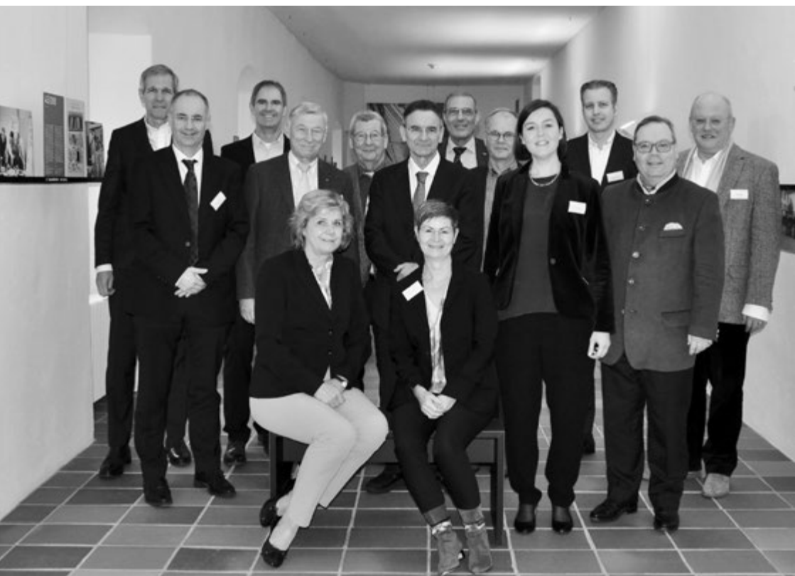
Board of Trustees and Governing Board at the last meeting at Kloostergut Paradies.